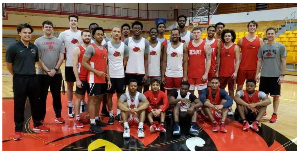
Wheeling University Mens Basketball