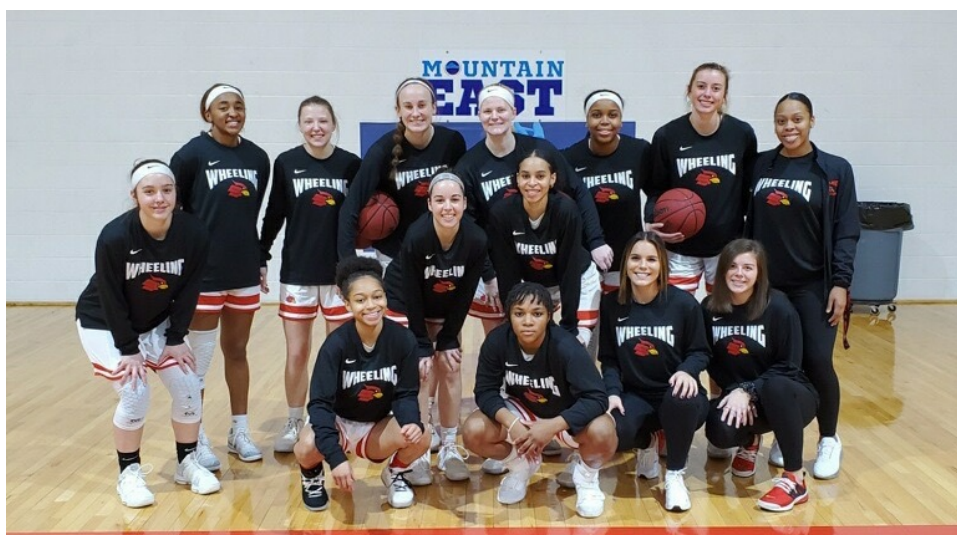
Wheeling University Women's Basketball