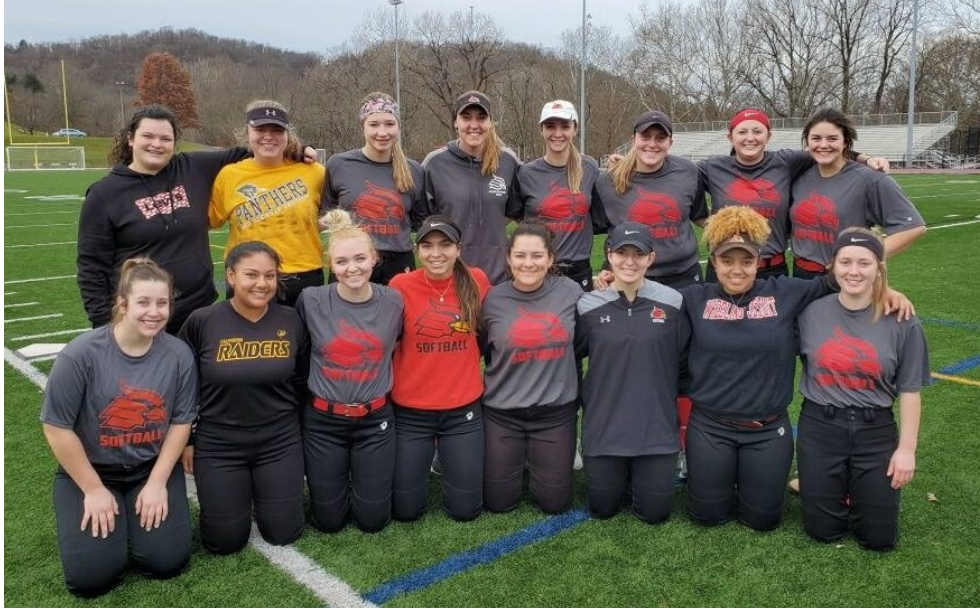
Wheeling University Softball