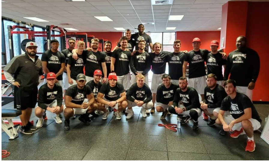
Wheeling University Varsity Baseball