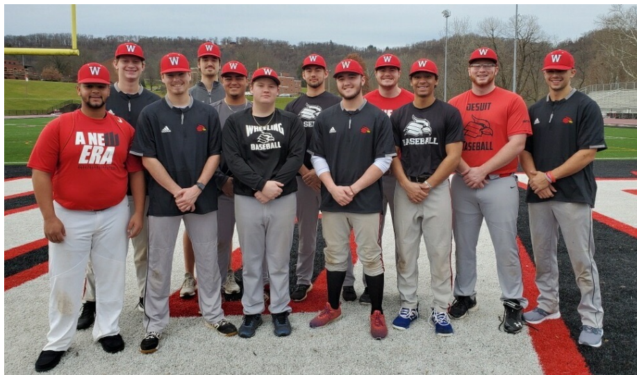
Wheeling University Varsity Baseball Pitching Staff